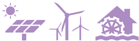
Power generation that utilizes renewable energy and local resources